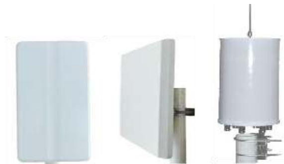
Outdoor Antennas (from left to right):