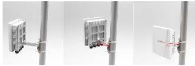
Adjustable Mount-kit of AP630